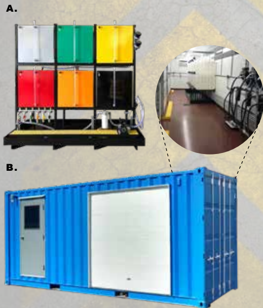
SHOWN: (A.) CUSTOM BULK SYSTEM BUILD, (B.) CUSTOM LUBRICATION STORAGE ROOM

Customization is available for Bulk Systems, Lubrication Storage Rooms, Filtration Units, Labeling/Fluid Identification , and more.