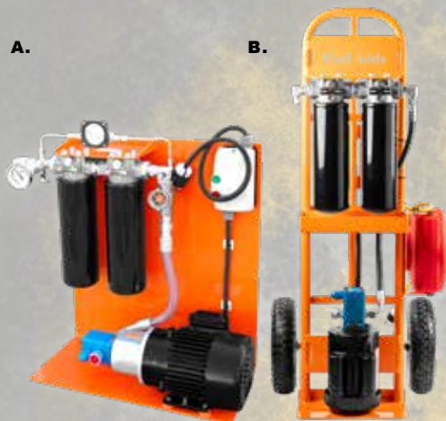
SHOWN: (A.) PANEL UNIT - #FFPUDC, (B.) HIGH PERFORMANCE FILTER CART - #FFHTDC —BOTH CUSTOM UNITS—