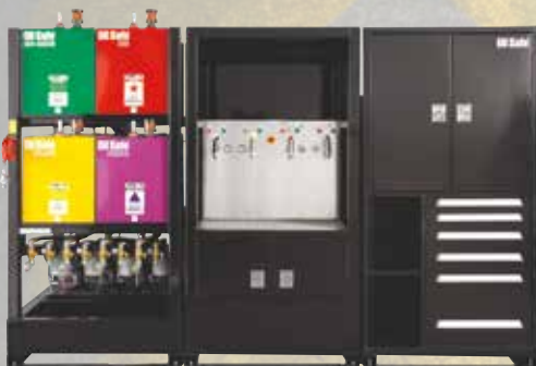
SHOWN: LUBRICATION WORK CENTER SYSTEM (#FF30400) W/ STORAGE CABINET (#FF90150)

The two main systems are the Advanced and the Lubrication Work Center . Each can be configured to meet your specific workplace requirements. Additional secondary systems are available to supplement lube management either in the field or in other areas of the workplace.