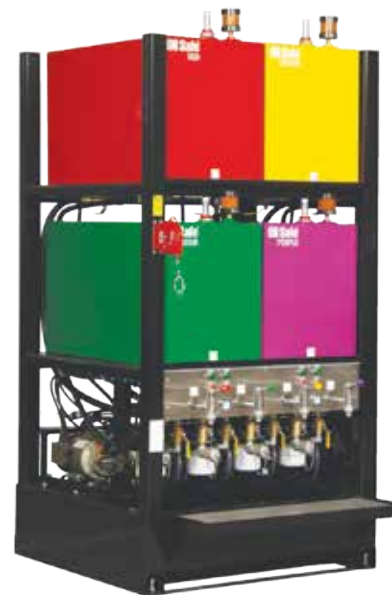
Advanced Lubrication System